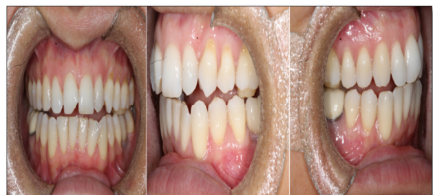
Figure 2. Frontal and lateral views of direct bite raiser onlays in the oral cavity.

The chance to act 24 h a day is the main advantage of DBRO compared to the stabilization splint that is considered the standard treatment. The distal position, not very visible, and the biomimetic composite materials in which they are made minimize the aesthetic impact (Figure 2). For these reasons the gnathological therapy by DBRO is particularly recommended for acute and persistent pain-related TMD, in which the patient should wear the stabilization splint, much more unwieldy and unaesthetic, as many hours as possible throughout the day [7].