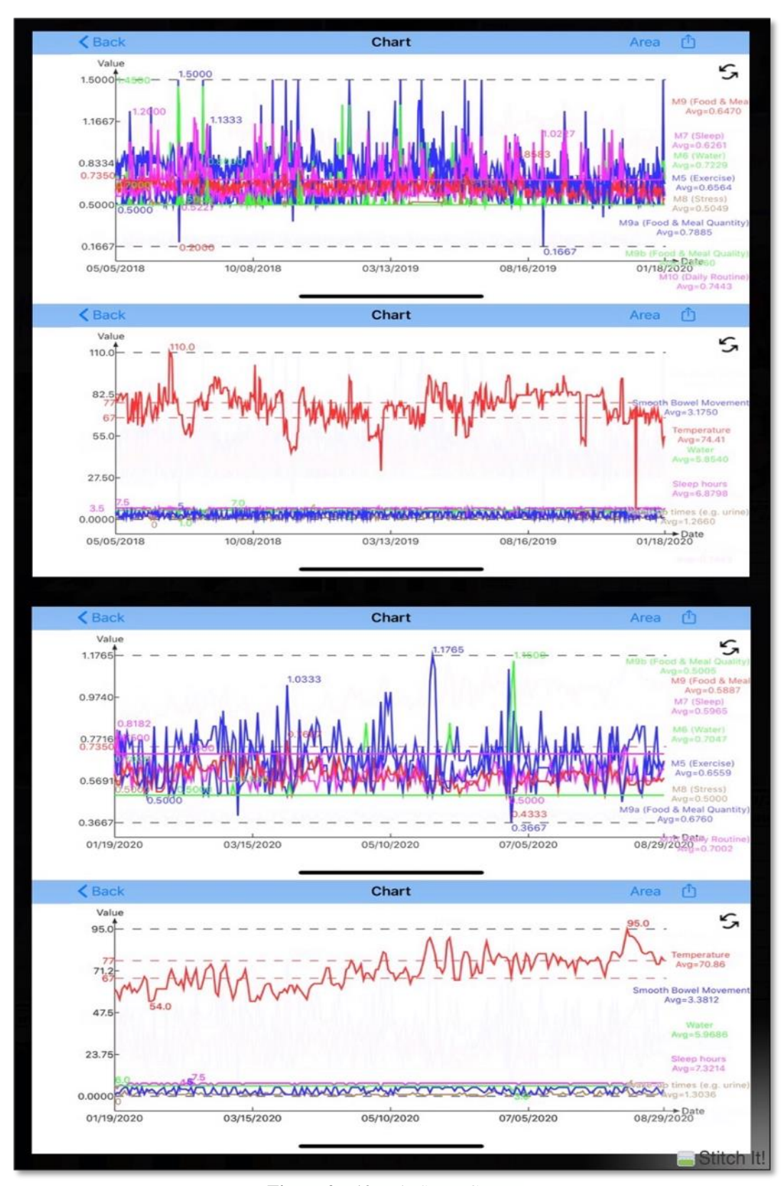
Figure 2. Lifestyle Score Curves.