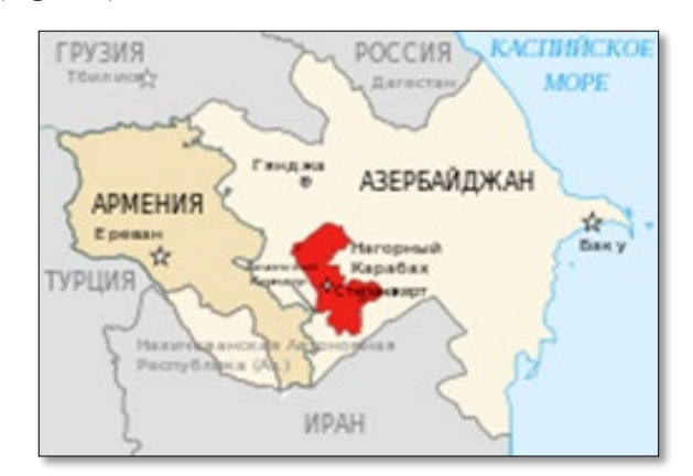
Figure 1. Map of Azerbaijan.

The purpose of our research is to study the methods of soil and fertilizer cultivation, improve soil fertility and winter wheat cultivation technology, which ensures higher yield and quality of grain in the Ganja-Gazakh zone of Azerbaijan (Figure 1).